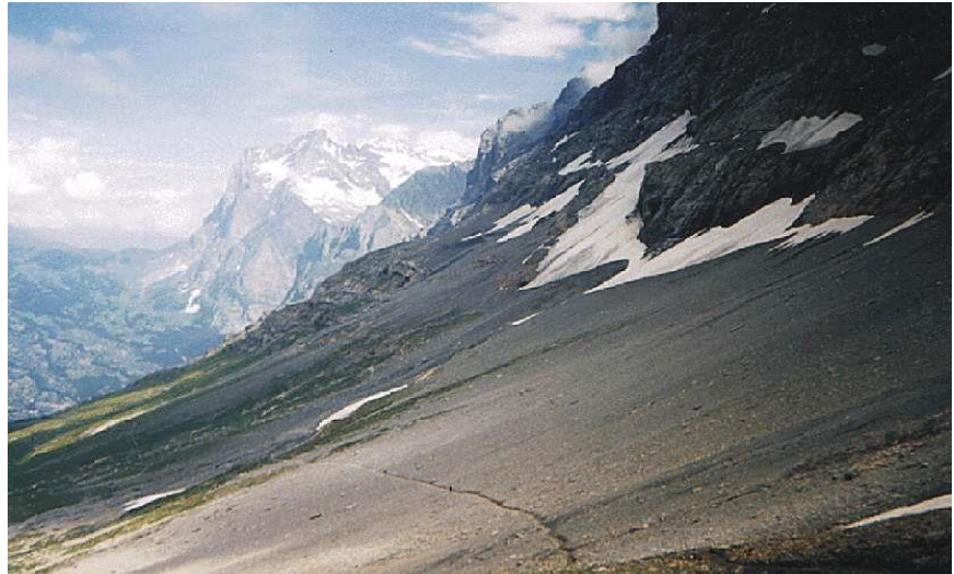
Figure 2 – An ideal location for the new laboratory

Please be aware that coloured diagrams and photographs frequently do not convert sensibly to black and white presentation. Again, it is the author's responsibility to check the presentation of these in the printed version.